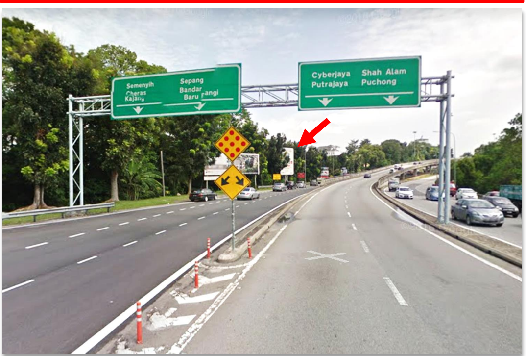
View from Kajang Toll Plaza (PLUS) towards Kajang / Bangi Interchange & Country Heights