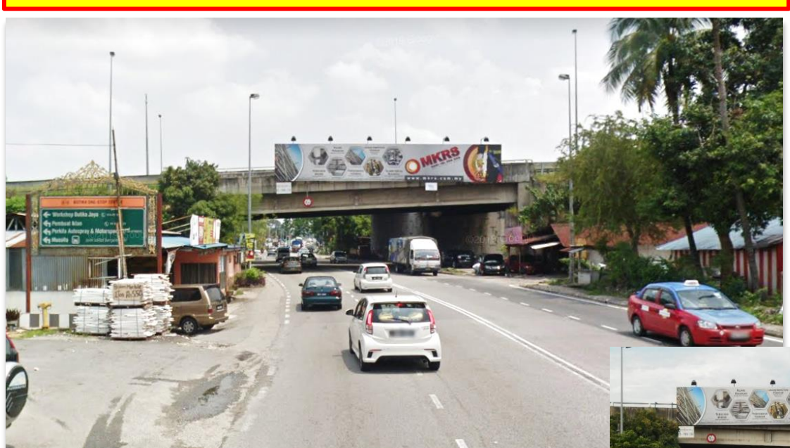
BANDAR KAJANG SUNGAI CHUA TAMAN KAJANG BARU TAMAN SRI SAGA TAMAN MAS TAMAN BIDARA TAMAN AUF MAHKOTA TAMAN BUI TAMAN BUKIT TAMAN AJANG RAYA SHK HIGHWAY TAMAN KAJANG JAYA SEMARAK TAMAN SAHABAT TAMAL MEV TAMAN SRI TAMAN LANGAT KAJANG UTAMA Available Immediate