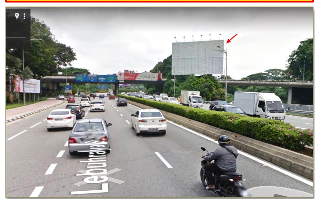
VIEW – FROM JALAN IPOH TOWARDS PARLIAMENT